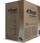
Biogel® PI OrthoPro®