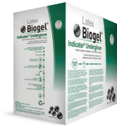
Biogel® Indicator® Underglove