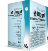
Biogel® PI Indicator® Underglove