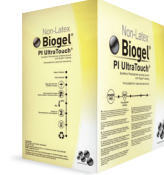
Biogel® PI UltraTouch®