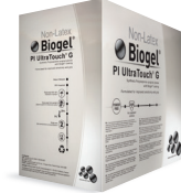
Biogel® PI UltraTouch® G