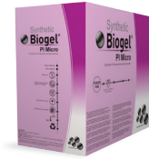
Biogel® PI Micro

A sterile, powder-free, synthetic polyisoprene glove that eliminates the possibility of glove-related latex protein sensitization because it is made from a synthetic elastomer. The glove provides levels of fit, feel and comfort comparable to natural rubber latex because synthetic polyisoprene shares a similar molecular structure to natural rubber latex.