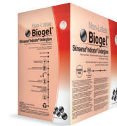
Biogel® Skinsense® Indicator® Underglove