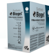
Biogel® PI Micro Indicator® Underglove