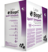
Biogel® Optifit® Orthopaedic