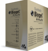
Biogel® PI Pro-Fit®