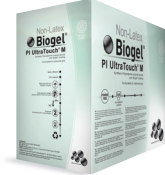
Biogel® PI UltraTouch® M