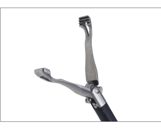
Babcock Grasping Forceps