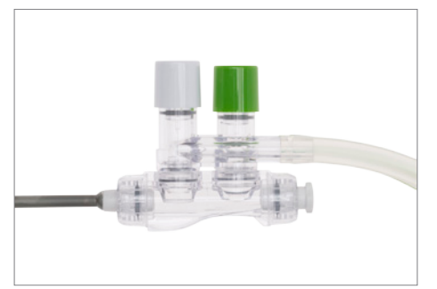
Suction and irrigation