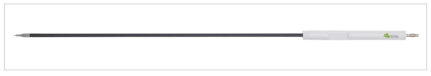
Monopolar L-hook electrode without cable